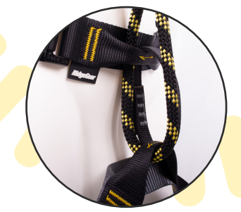
Front attachment point