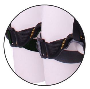
Colour coded webbing