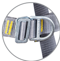
Front attachment point