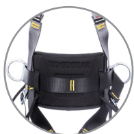
Work positioning belt