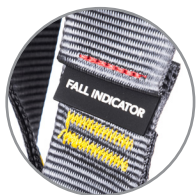
Rip stitch indicators