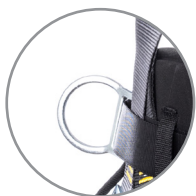
Fold back D rings