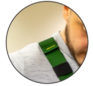
Bigger Webbing turnbacks