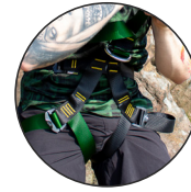
Coloured right leg loop