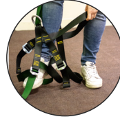
Step in design