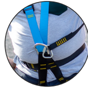
Ventral attachment point