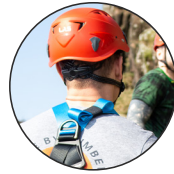
Elastic webbing retainers