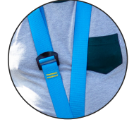
Easy slide buckles