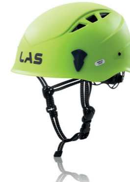
LIME LW00020020 029