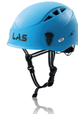
LIGHT BLUE LW00020020 026