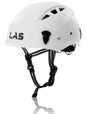
WHITE LW00020020 001