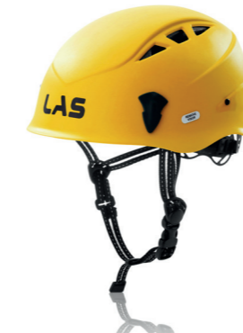
YELLOW LW00020020 024