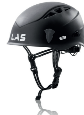
BLACK LW00020020 002